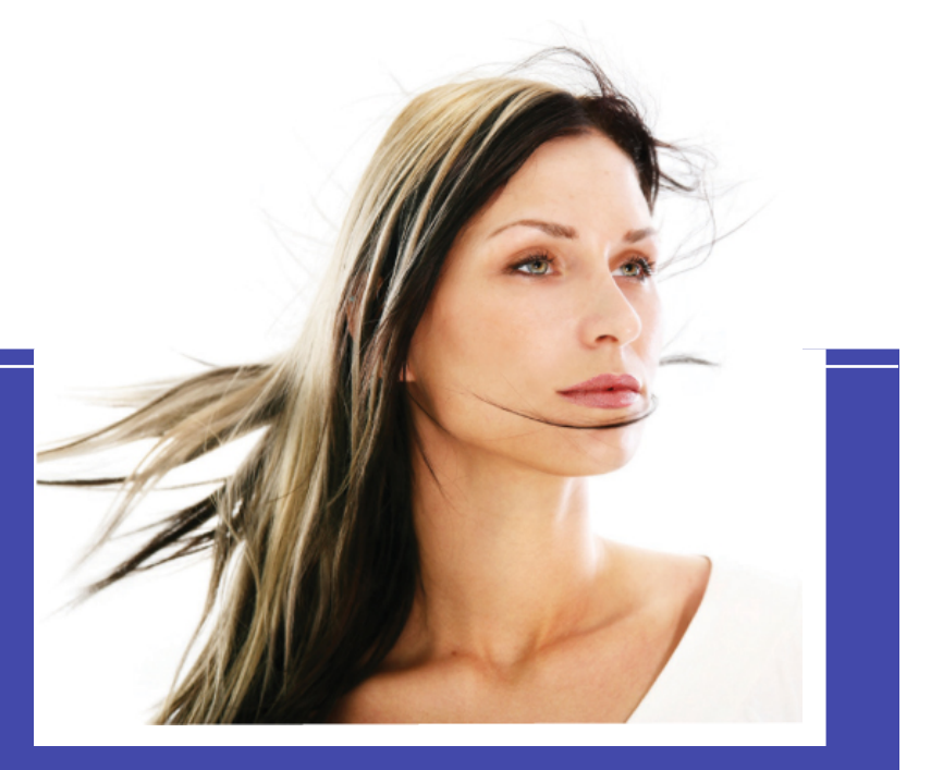
MESO PURE PEEL meets the standards for ecological and organic cosmetics according to ECOCERT (www.ecocert.com).

With the advent of MESO PURE PEEL, it seems that we have combined natural purity with excellent activity. While AHAs have a potential to be irritating to skin, they also effectively stimulate cell renewal. Biopeel surpasses the activity of the synthetic lactic and glycolic acids. In Biopeel, we have maximized the ability to stimulate cell renewal, while minimizing the potential for irritation.