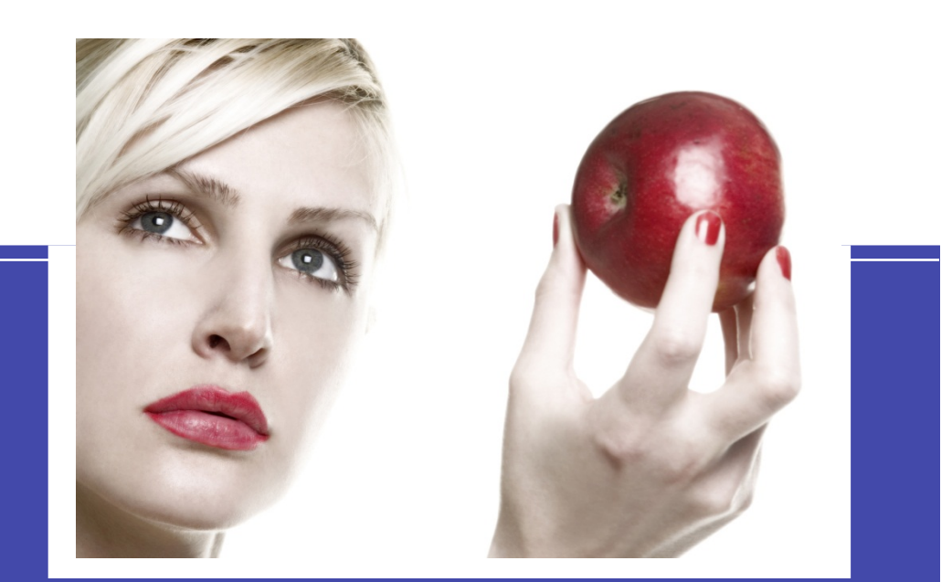
MESO PURE PEEL meets the standards for ecological and organic cosmetics according to ECOCERT (www.ecocert.com).

Glycolic acid exhibits the most keratolytic ability of any of the AHAs. Citric acid, when topically applied, stimulates collagen synthesis. Both tartaric and malic acid boost skin elasticity. Lactic acid is a highly effective moisturizer