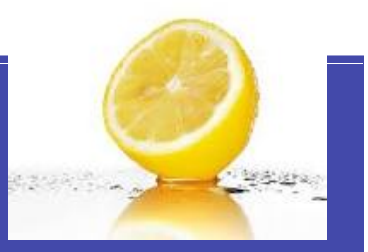
MESO PURE PEEL meets the standards for ecological and organic cosmetics according to ECOCERT (www.ecocert.com).